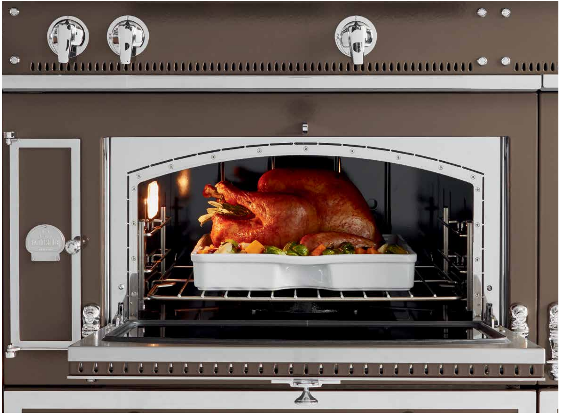
CHÂTEAU GRAND VAULTED GAS OVEN in COCOA with POLISHED CHROME TRIM