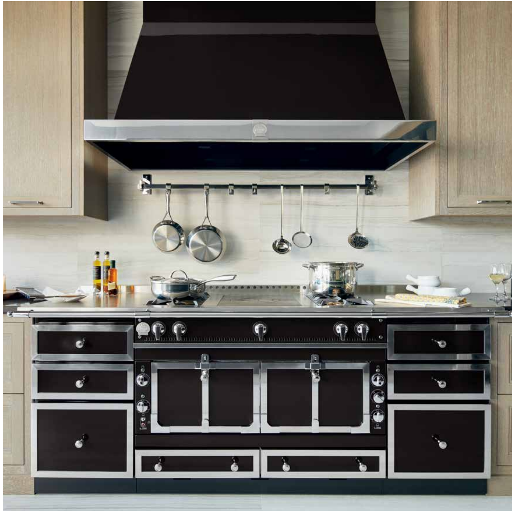
CHATEAU 120 in ULTRA BLACK with POLISHED CHROME TRIM. EXTENDED RANGETOP & HANDRAIL SHOWN.