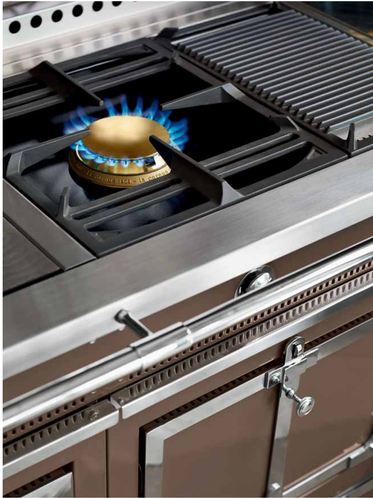
CHÂTEAU 150 in COCOA with POLISHED CHROME TRIM