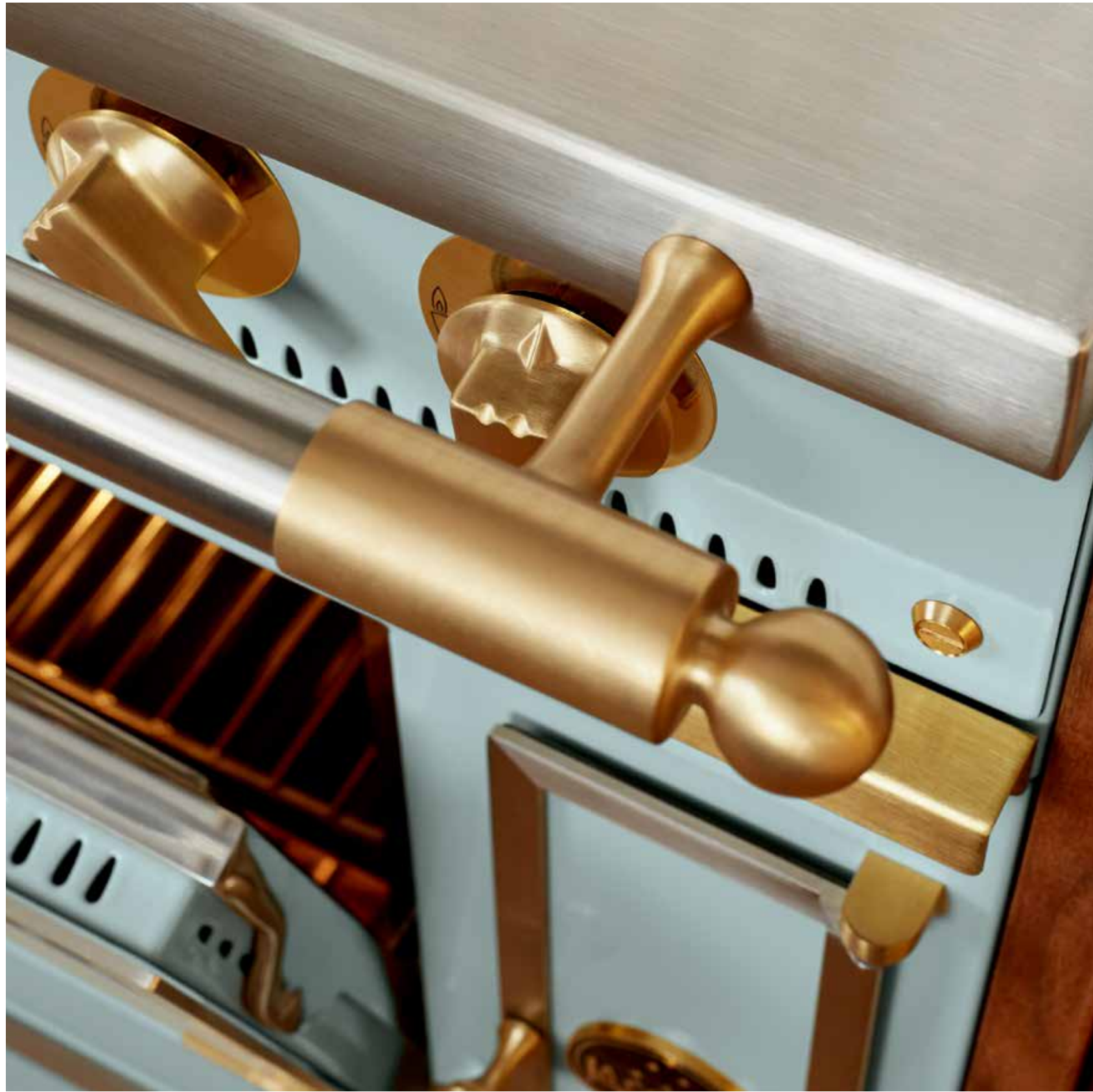
CHÂTEAU in ROQUEFORT with STAINLESS STEEL and BRUSHED BRASS TRIM