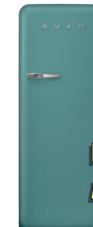
Emerald Green FAB28RDEG3