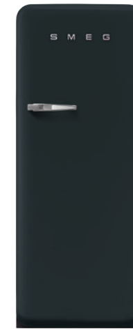
Black Velvet FAB28RDBLV3

Energy efficiency class A+++ Noise level: 38 dB(A) Energy consumption: 139 Kwh per year Freezing capacity: 2 Kg/24h Thaw time: 12 h Dimensions (HxWxD): 153x60x72,8 cm