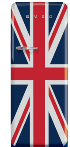
Union Jack FAB28RUJ3