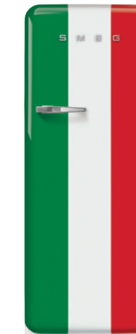
Italian flag FAB28RIT3