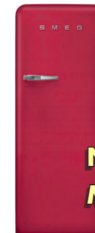
Ruby Red FAB28RDRB3