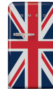
Union Jack FAB10RUJ